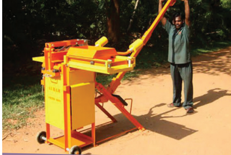
A Compressed Earth Block press in action.