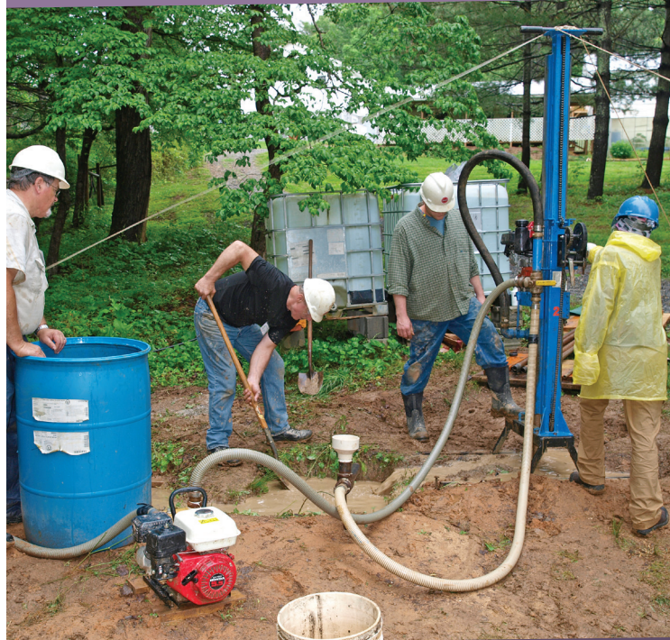
Well Drilling students learn how to utilize a mud rotary drill, locate an aquifer on Equip's property, and install a hand pump.